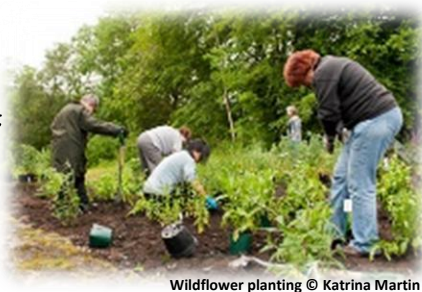
Wildflower planting

Wilder Wight Communities is on the lookout for local spaces which can be made more nature friendly. It is a partnership project between Southern Co-op and Hampshire & Isle of Wight Wildlife Trust and is all about encouraging people to take action to create and enhance the spaces where they live to give wildlife a helping hand. We want to see more wildlife friendly areas and small outdoor spaces for nature across the Island that are created and supported by the community.