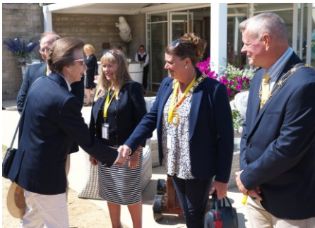
Royal Visit During Cowes Week