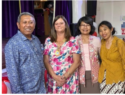
Indonesian Day Celebration