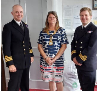
HMS Severn Visit